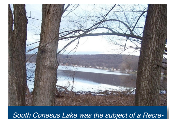
ational Trails Program Grant

Since beginning our work in the County, we have had the opportunity to work with a number of experienced and committed Livingston County employees, as well dedicated municipal staff, elected officials, and volunteers. We look forward to continuing to build on these relationships and develop new ones as we partner with the County to create a better future.