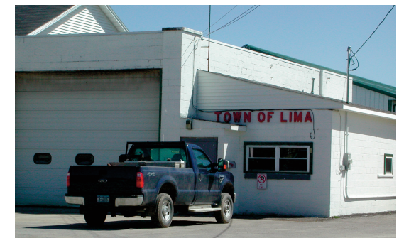
The Town of Lima will install solar panels on the roof of its Highway Garage